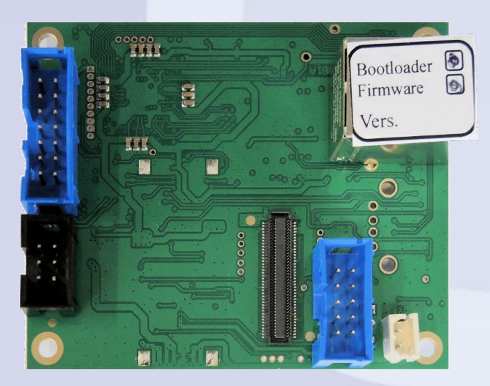
SEXC30REMD – connector side